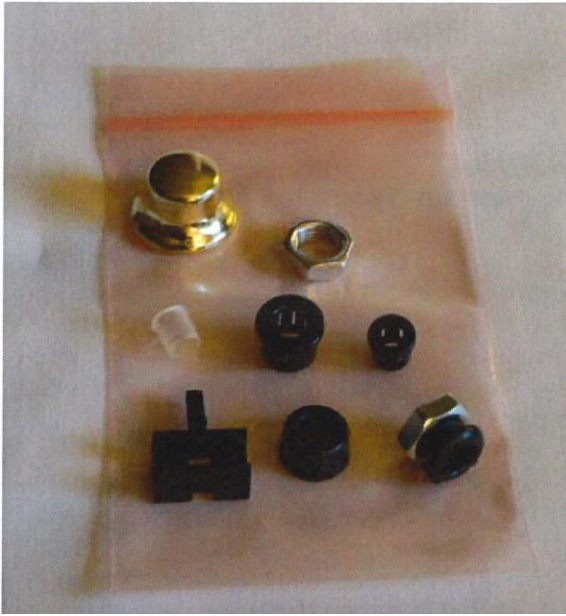
Picture of various grommets, bushings, nuts, in line strain relief, and cap for threaded rod.

Then the 4-H Extension Office also purchased a box with a variety of replacement parts: various plastic bushings, nuts, rubber grommets, brass bushing w/nut, 1" x 1/8 IPS threaded nipple, cord maze (strain relief in lamp base) and 1/2" harp risers. The price of each part is marked on the box and range from 25 cents for 2 up to 75 cents each.