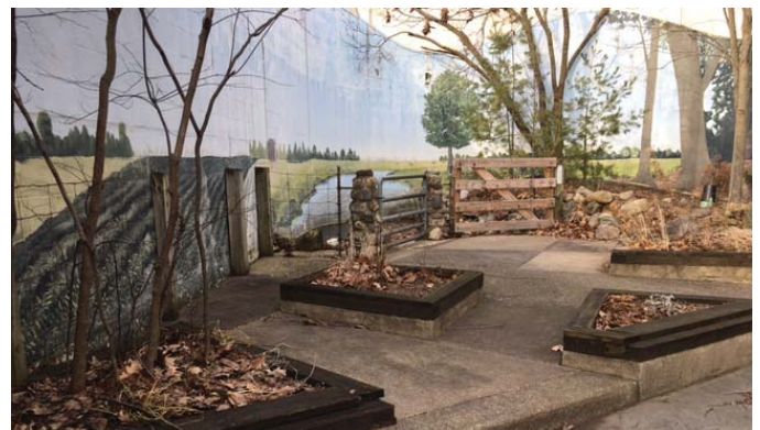
ABOVE: The current state of the courtyard garden at the Muncie Children's Museum.

plant bed will focus on 1 of 4 learning objectives: butterflies, prairie, water, and sensory. The committee is looking at adopting the courtyard as a DCMGA community garden. The committee would host public workdays where Master Gardeners would educate children about the four objectives and lead volunteers as they re-plant the beds. The committee is also looking into purchasing signage that could provide educational information about the plants.