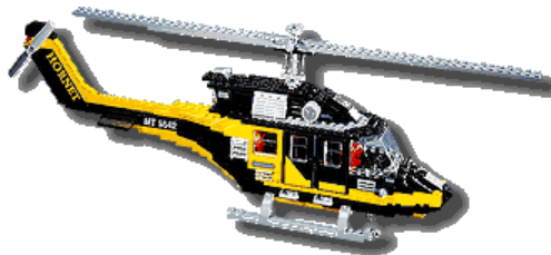
EXHIBIT: Build a structure such as a house, skyscraper, a barn, any type of building or some type of vehicle such as a car, truck, plane, tractor, farm implement, boat, etc. Turn in a completed record sheet.