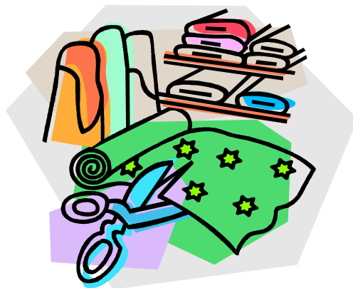
Exhibit one article or set of articles that shows an improvement of skills and application of color or design. Original designs or altering of patterns is encouraged. Special occasion, seasonal items and embellishments (such as glued on jewels, iron on appliqués, trims, and beads) may be used. Advanced preprinted fabric projects and advanced kits may be used in Levels C & D. Original designs, simple preprinted fabric projects, simple kits, no-sew fleece items or patterns can only be exhibited in Levels A & B.