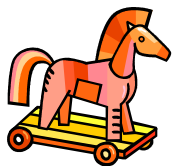
Exhibit: Build and exhibit two of any related objects (new exhibits) from either Level A or B. Examples could be: two animals, two statues, two cars, etc. NO motorized units will be allowed. Attach a 3" X 5" index card to the exhibit describing the project.