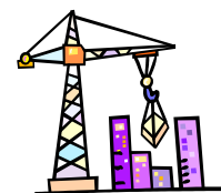
Exhibit: Build and exhibit a display of at least three objects that are related to each other. Some suggestions could be three cars, a tractor with two other pieces of machinery, a set of three building, or possibly the combination of a building and two vehicles. The display will not be larger than 2' X 2' square. Motorized units will be allowed in this category only. 4-H members in this category should show a great deal of thought and ingenuity in design and construction. Attach a 3" X 5" index card to the exhibit describing the project.

Maximum project size will be limited to 24" X 24" by 36" for all levels. All exhibits must have a solid base.