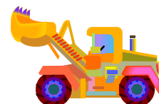
Exhibit: Build a structure ( such as a house, skyscraper, barn, etc ), or some type of vehicle ( car, truck, plane, tractor, farm implement, boat, etc. ). NO motorized units will be allowed in this category. Attach a 3" X 5" index card to the exhibit describing the project.